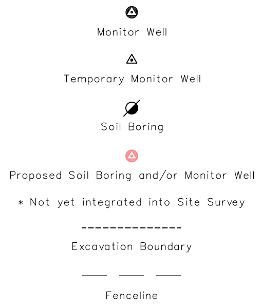
FIGURE ADAPTED FROM SURVEY PERFORMED BY: